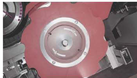
B & H's patented constant velocity starwheel system is standard on BH1600AB labelers.

The Allen-Bradley touch screen interface of the operator control station combined with B & H's patented constant velocity starwheel system simplifies machine set-up. The touch screen displays feature easy system navigation and password security, and dedicated screens are provided for container and label parameters, alarm history, and system troubleshooting. Together these features help the operator get and keep the labeler running.